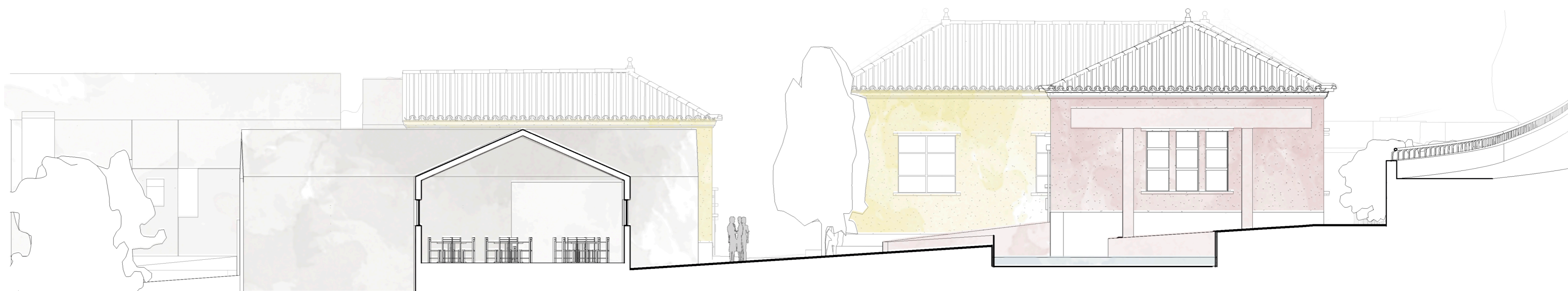
CORTE BB E1/100