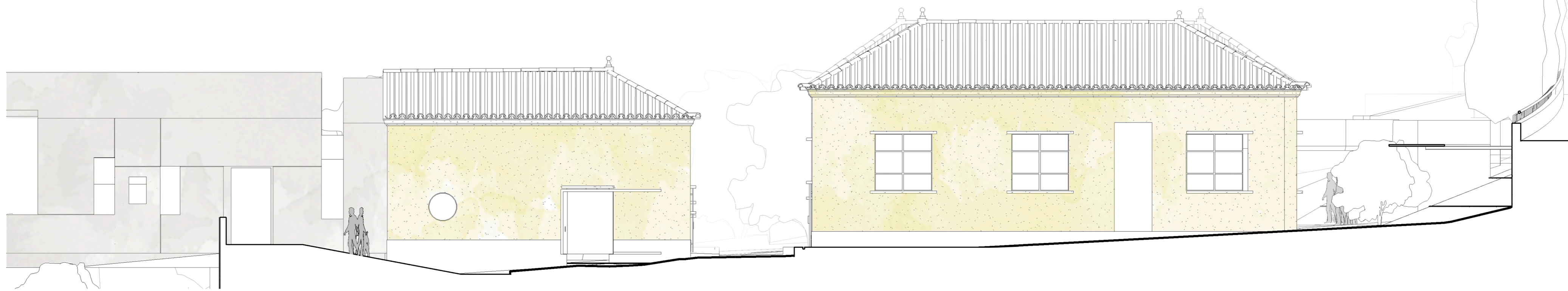
CORTE AA E1/100