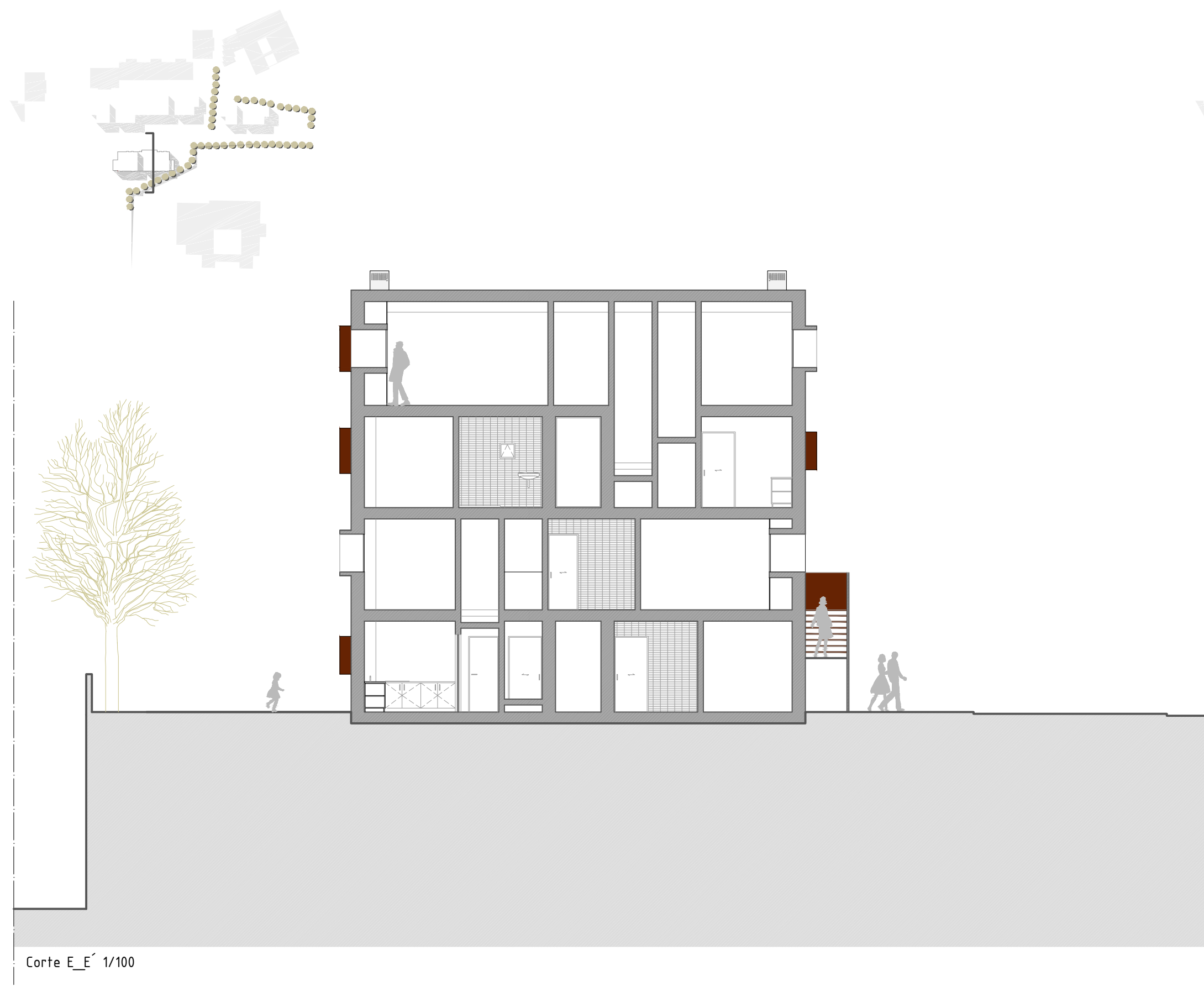
Corte E_E' 1/100