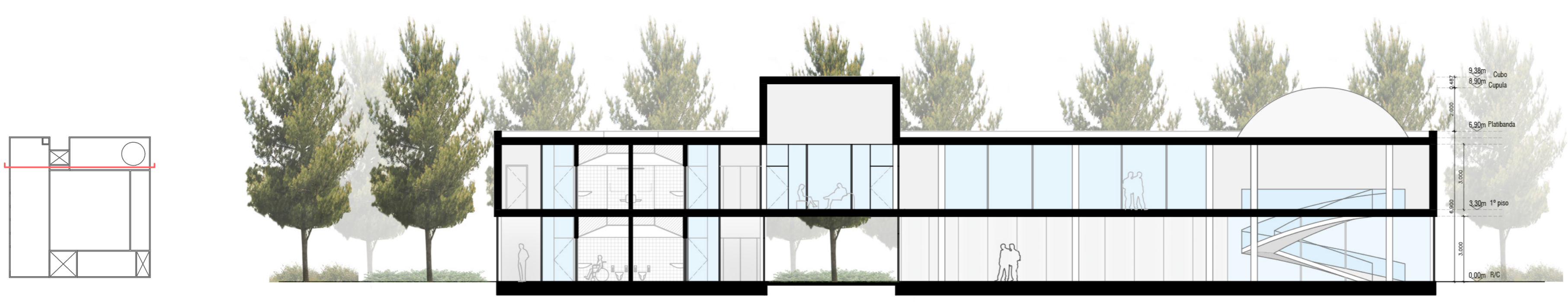
Corte c-c' esc.1.150