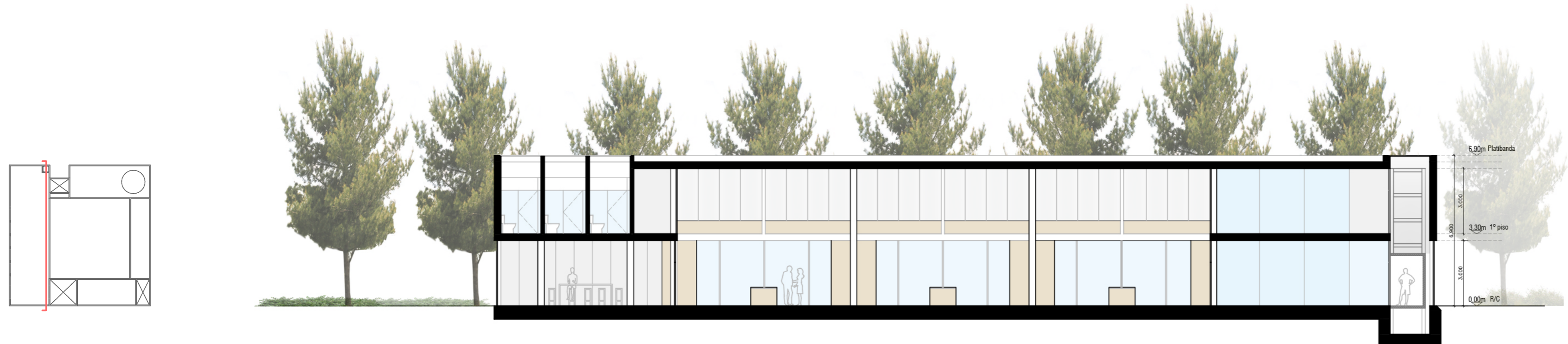
Corte f-f' esc.1.150