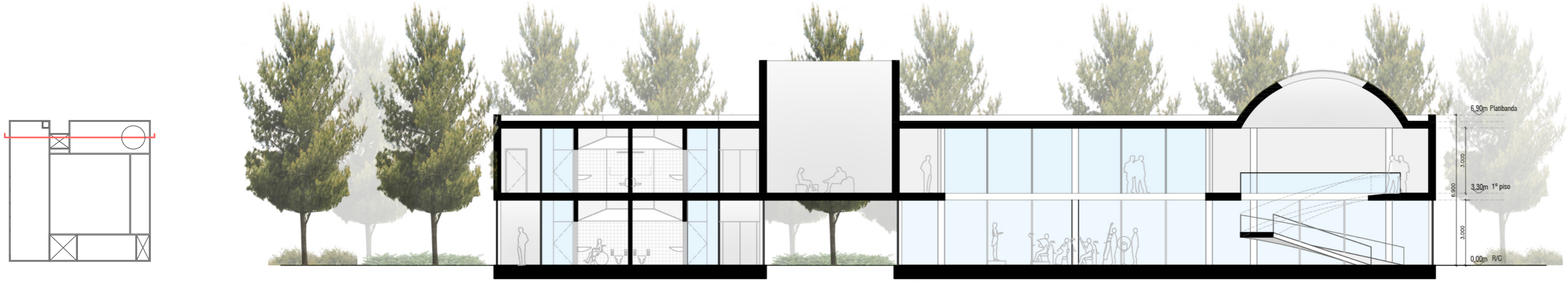
Corte b-b' esc.1.150