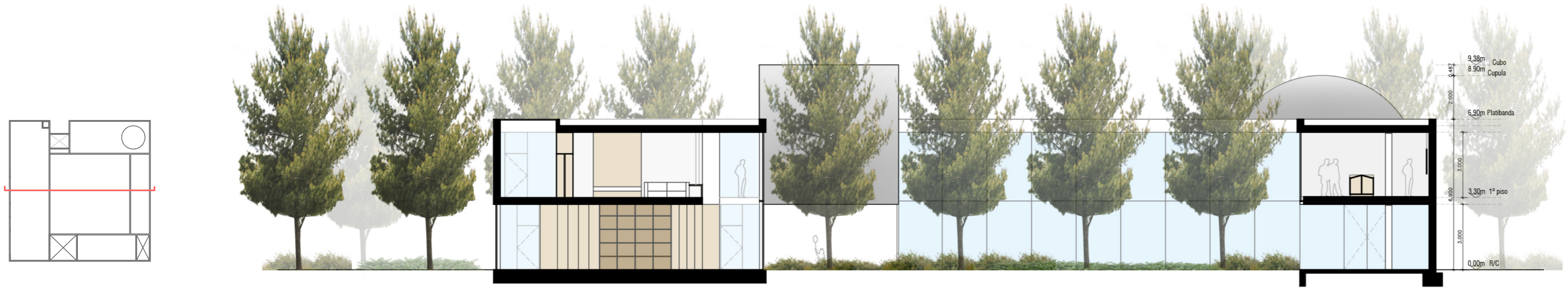
Corte d-d' esc.1.150