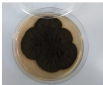
Figure 2. Cladosporium sp. , 20 days growth on MEA plate

Fungal samples were mounted on lactophenol blue and visualized under optical microscope and identification of fungal colonies was based upon phenotypic characteristics and followed standard mycological procedures according to their micro and macro-morphological characteristics [16].