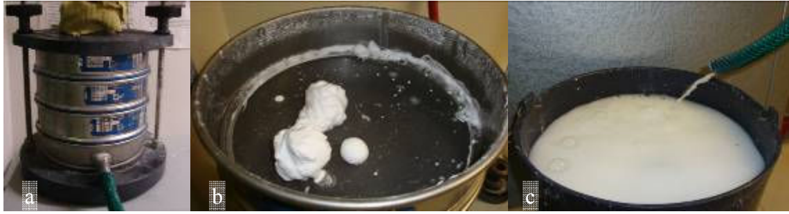
Fig. 2. Size class separation processes: a) vibrating sieves set-up; b) wet screening; and c) suspension of <500 mesh powder.

The mixture of the appropriate amounts of powders of matrix and aggregate with water was done in a mortar mixer (Fig. 3a), as described in the Portuguese patent #103432 (2008). Constant contents of 28mg water/m 2 SSA and 0.36mg citric acid/m 2 SSA (dispersant) were used for all the mixtures [3,8,11]. 87% of the calculated water requirement [8] was added to the powder mixture (Fig. 3b) at a rate of <8g/min in an intermittent way (Fig. 3c). This procedure is fundamental to minimize segregation and improve thorough wetting of powder surfaces, thus reducing the volume of needed water. The final 13% water is just enough to take the mixture through the self-flow “turning point”. Further details of the mixing procedure can be found elsewhere [9,10].