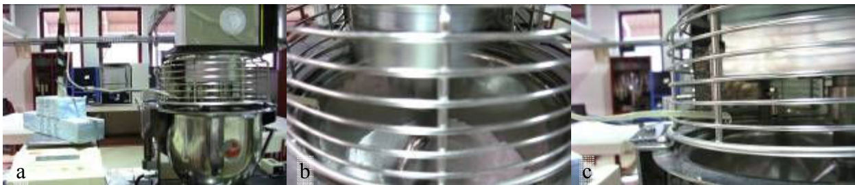
Fig. 3. Mixing procedure: a) mortar mixer; b) dry mixture of powder size classes; and c) intermittent (drop-by-drop) water addition.

The mixture of the appropriate amounts of powders of matrix and aggregate with water was done in a mortar mixer (Fig. 3a), as described in the Portuguese patent #103432 (2008). Constant contents of 28mg water/m 2 SSA and 0.36mg citric acid/m 2 SSA (dispersant) were used for all the mixtures [3,8,11]. 87% of the calculated water requirement [8] was added to the powder mixture (Fig. 3b) at a rate of <8g/min in an intermittent way (Fig. 3c). This procedure is fundamental to minimize segregation and improve thorough wetting of powder surfaces, thus reducing the volume of needed water. The final 13% water is just enough to take the mixture through the self-flow “turning point”. Further details of the mixing procedure can be found elsewhere [9,10].