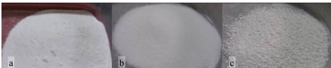
Fig. 1. General aspect of the three different size classes of commercial tabular alumina powders that compose the aggregate: a) [0.2-0.6 mm]; b) [0.5-1.0 mm]; and c) [1.0-3.0 mm].

Commercial tabular alumina T60 (Alcoa), available in four different size classes (<0.2mm, 0.2-0.6mm, 0.5-1mm and 1-3mm), was used as raw material. Based on previous work [8], a constant aggregate size composition was selected (21.7% [0.2-0.6mm], 21.7% [0.5-1mm] and 56.7% [1-3mm]). Fig. 1 illustrates the morphology of the three coarser powders used as aggregate in this work. This aggregate composition was added in various proportions to an optimized matrix, also of constant size composition, containing three fine size classes [10], namely: 20% of <230 mesh class; 20% of <500 mesh class and 60% of CT3000SG reactive alumina (Alcoa).