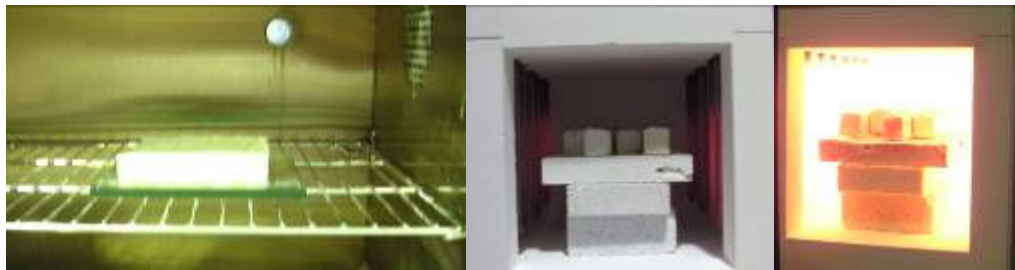
Fig. 6. Test pieces drying at 110°C and sintering process (1600°C).