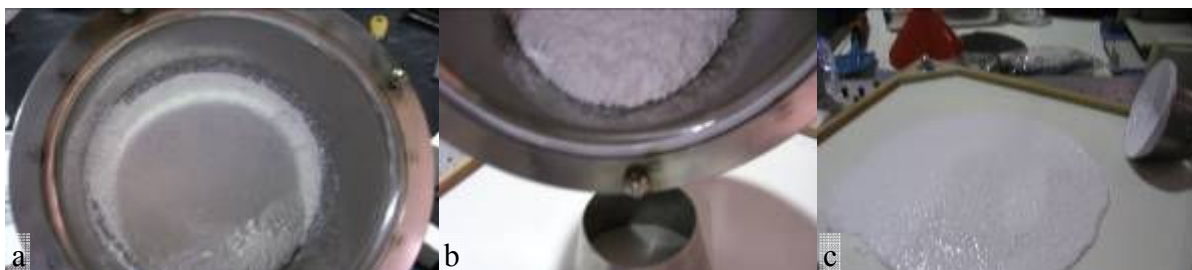
Fig. 4. Determination of flowability index using the slump test: a) fresh paste; b) casting the paste into the slump cone; and c) radial spreading of the fresh paste.

After drying, the test pieces were sintered at 1600°C (Fig. 6) following the thermal schedule described in the ASTM C865-02 standard. Cold mechanical strength (MoR) of fired test pieces was evaluated as three-point bending strength (ASTM C133). Each test result is the average of measurements of three different test pieces for each composition.