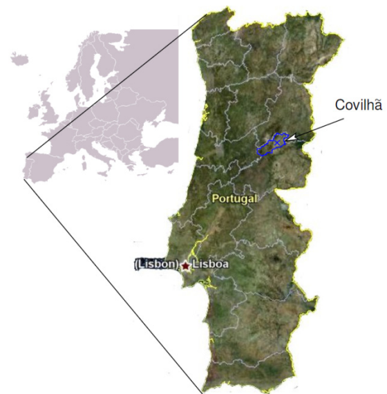
Fig. 1: Map of the region.

For the automated method, the light absorption coefficients were measured at three wavelengths (470, 522 and 660 nm) with a PSAP working with the air flow set to 1.5 l/min. The instrument uses a filter-based technique in which aerosols are continuously deposited onto a glass fiber filter at a known flow rate. The change in the transmitted light is related to the optical absorption coefficient using Beer's law. The instrument is an improved version of the integrating plate method [3] and is described in detail by [4] and [5].