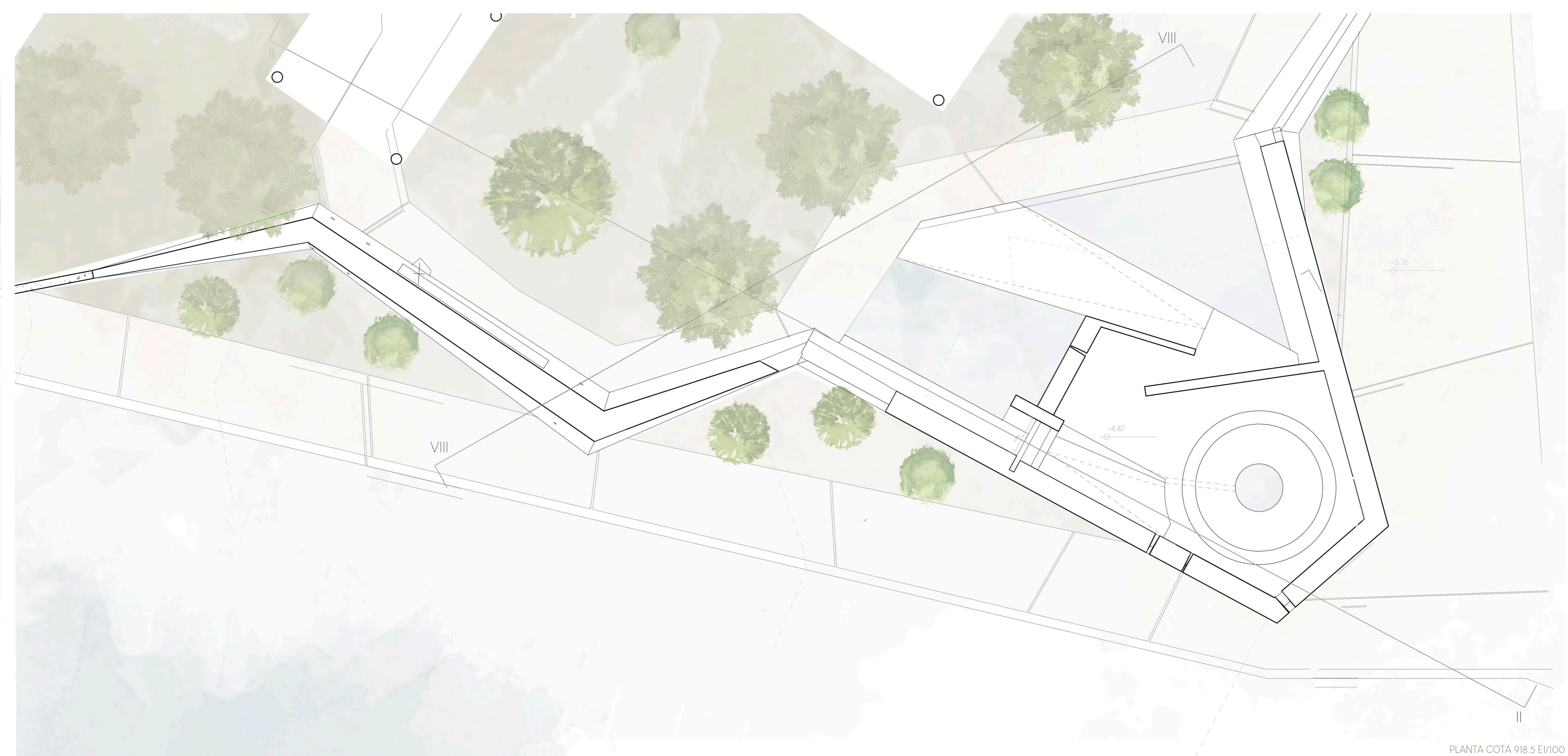
PLANTA COTA 918.5 E1/100