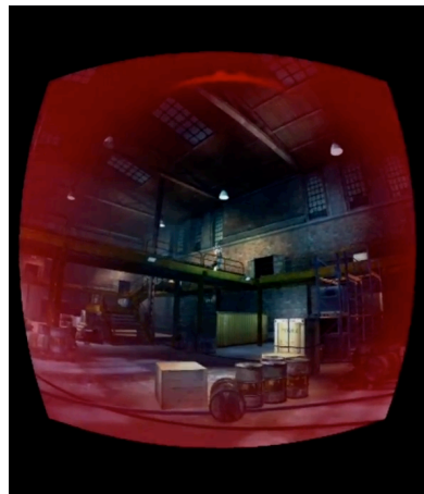
Figure 5: Element Engine, Screenshot of the gameplay, Meta representation.

The UI of Element Engine [14] gameplay shown in figure 5 is classified as Meta representation because it's not in a 3D game Space but exists in the fictional game world story. In this case, the red border indicates that the player is taking too much damage, representing the health points.