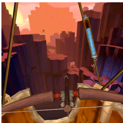
Figure 4: Balloon Shooter, Screenshot of the gameplay, Diegetic representation.

The UI of Balloon Shooter [13] gameplay shown in figure 4 is classified as Diegetic representation because it's in a 3D game Space and exists in the fictional game world story. In this case, the user interface in the gameplay is a blue capsule "fuel" who represents the health point of the balloon, every time the player takes damage the fuel decreases.