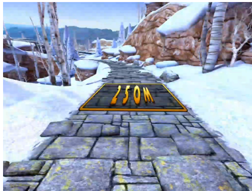
Figure 3: Temple Run VR, Screenshot of the gameplay, Spatial representation.

The UI from Temple Run VR [12] shown in figure 3 fits in the geometry of the street environment to give some information such how much meters the player needs to run to complete the game. This user interface is classified as Spatial representation because it's in a 3D game Space and does not exist in the fictional game world story.