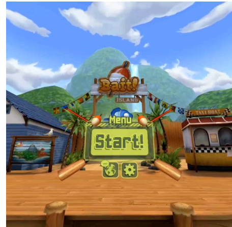
Figure 2: Bait!, Screenshot of the menu, Non-Diegetic representation.

The game menu from Bait! [11] shown in figure 2 is classified as Non-Diegetic representation because it's not in a 3D game Space and does not exist in the fictional game story. This menu is just flat 2D text and an image rendered in the screen.