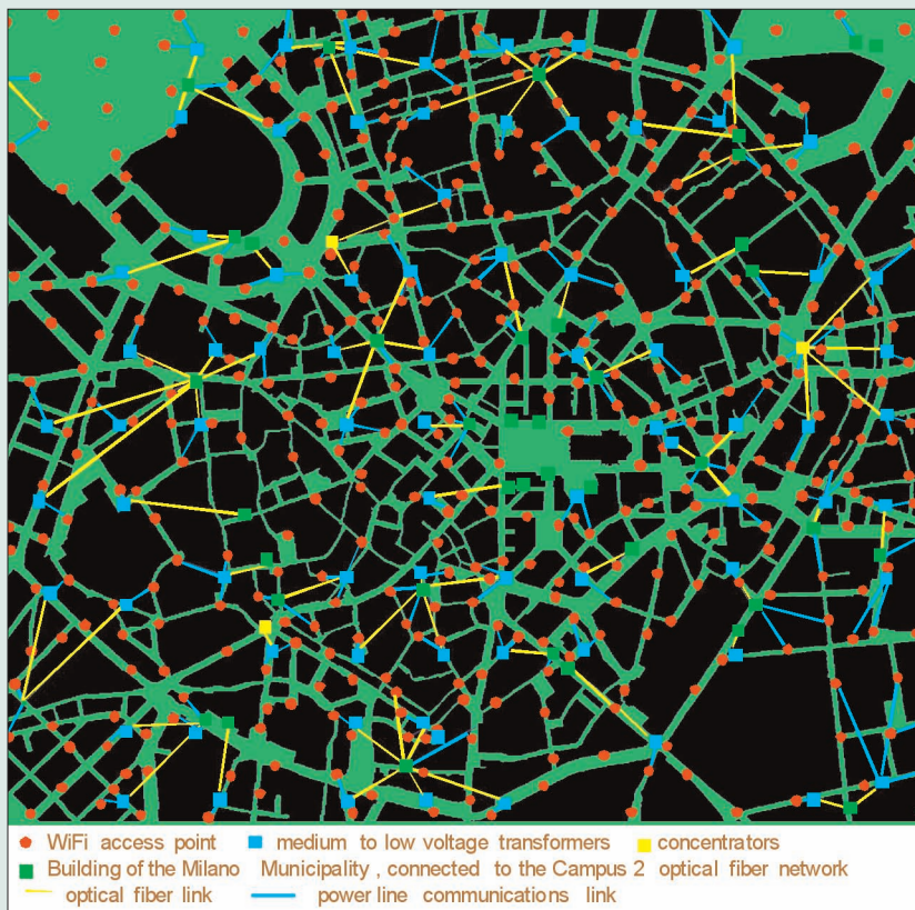
■ Figure 2. Planning of the radio coverage and backhauling of the central area of Milan (about 5 km 2 ).

These services require independence from the network platform and the possibility of guaranteeing diverse performance and quality levels in different zones of the city. In conclusion, the services provided by the Milano Città Digitale platform are the main objective of the current activity in the modernization of the city, and the Department of Information Systems of the municipality contributes to the definition of the technological platform for service provisioning.